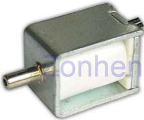
总重量 Total Weight: 18g 应用范围: 食品真空包装机 APPLICATION: FOOD VACUUM PACKING MACHINE

ISO/TS16949 ISO9000 ISO14000 RoHS REACH CE UL VDE TÜV