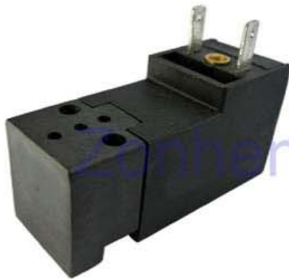
总重量 Total Weight: 30g 应用范围: 工业气路控制系统 APPLICATION: AIR ROAD CONTROL

ISO/TS16949 ISO9000 ISO14000 RoHS REACH CE UL VDE TÜV